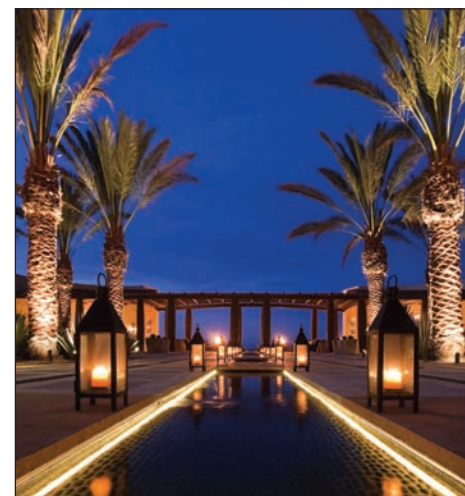
Lanterns guide guests from the hotel's tunnel entrance to its open-air lobby.

In addition to the personal assistants, each room, from the most basic ocean-view digs to the presidential villa, has its own patio and infinity-edge plunge pool. Unlike at some other Mexican resorts, these pools are actually cool and clean. Since the ocean is too rough for swimming, the private pools are a nice respite from the resort's three public ones, pretty and inviting though they are. The rooms also have fireplaces and are minimally chic with dark-wood furnishings, comfortable chairs and soothing cream walls and bedding. Pops of pale-green and yellow textiles and local artwork add interest. The bathrooms have deep, old-fashioned tubs and open rainforest showers. Binoculars for sailboat watching, a mini fridge filled with drinks and an espresso machine are nice touches. If the rooms had iPod players (which they may by the time you read this), they would be near perfect. They are, in a word ... sexy.