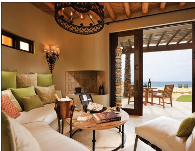
A suite offers chic furnishings and a spot for alfresco dining.